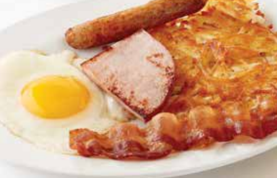
55+ Breakfast Sampler